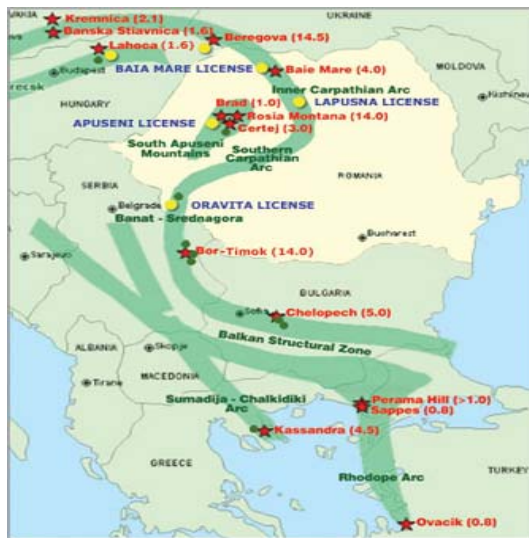
★ Location of major Gold deposits ● Porphyry Gold/Copper deposits found along Eastern Europe's Carpathian Arc. ● Carpathian License Location of major gold deposits

The proposals share several characteristics: